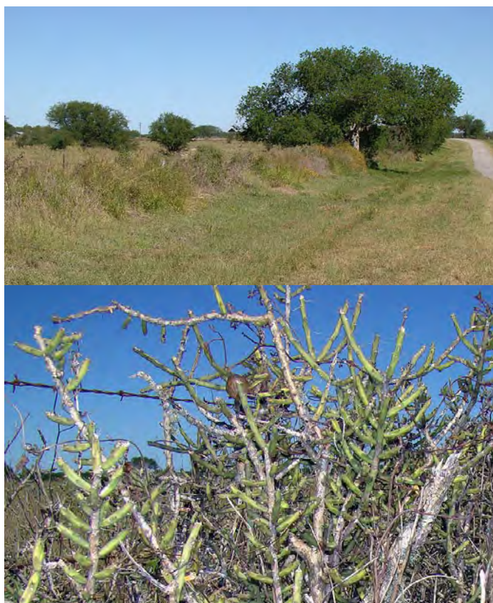
Figures 1-2. Chloroplus cactocaetes habitat

Armed with Jimmy's hand-drawn map, on the chilly morning of 5 November 2010, I visited the site, a quiet lane through farmland with scattered oaks. I didn't have a lot of time, as I was expected several