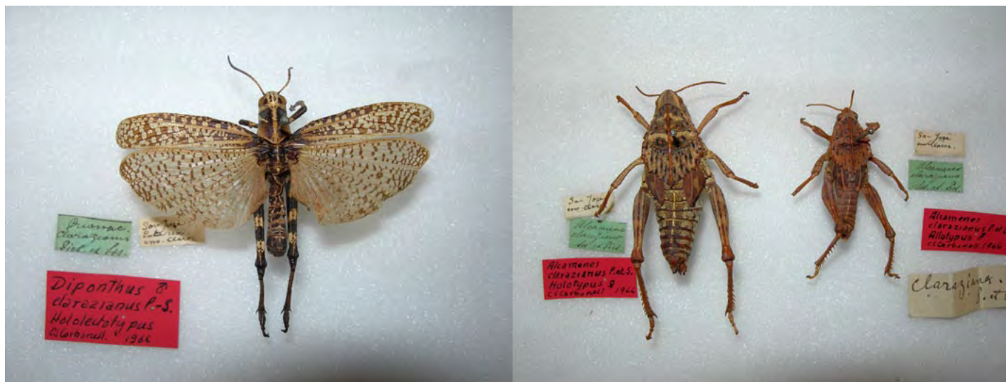
(left) Syntype of Diponthus clarazianus Pictet & Saussure, (right) Syntypes of Alcamenes clarazianus Pictet & Saussure

wide correspondence with European and American specialists (Kradolfer, 2003) and collected an imposing body of material, sending many specimens to museums in Switzerland and Britain (Hux, 1975). These specimens were mainly from the area around Bahia Blanca and the Swiss settlement of San José (Entre Rios State), but some were collected during his Patagonia expedition or (in the case of some ethnographic and fossil material) procured from elsewhere.