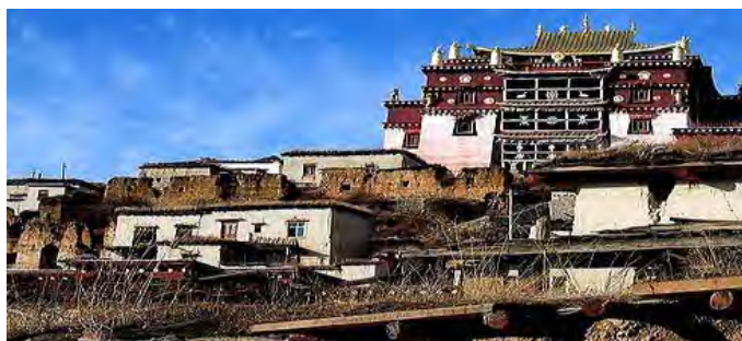
Gedansongzhan Temple, Shanglila, Yunnan

Kunming is a beautiful city, located in the center of the Yunnan-Guizhou Plateau, which has a long history. About 30,000 years ago, local inhabitants lived mainly around Dian Lake in Kunming. By about 286 BC, Kunming was a capital of southwest China. Besides many fascinating historical sightseeing options, this area has amazing natural beauty. Kunming is surrounded by lakes and hills, with many attractive destinations, such as Stone Forest, Gold Palace Park, Culture Exhibition Center, Dian Lake, Lijiang Ancient City, Shanglila (also known as Shangri-la), and Xishuangbanna (home to China’s last remaining