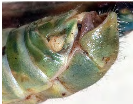
Figure 4. Chloroplus cactocaetes male cercus

hours further south that afternoon. I examined at least 100 m of open fence row with rather sandy soil that supported a growth of Pencil Cactus (Figs. 1 and 2). Three C. cactocaetes (two males and a female) were encountered—two on cactus and one on grasses (the latter jumped to a nearby cactus). Although Hebard described Chloroplus as being extremely alert with unusual leaping powers and being quick to hide, I was able to take all three individuals by hand, an exercise that required some finesse. I suspect that the cooler temperature and perhaps the lateness of the season made them easier to catch (as well as the female missing one hind leg). Also present along the