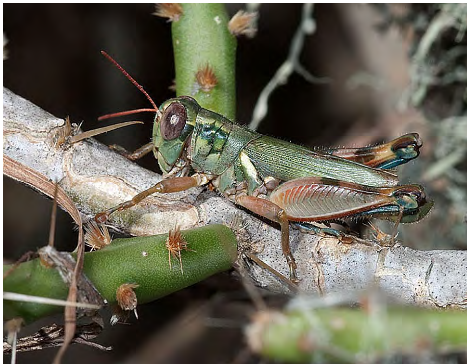
Figure 3. Chloroplus cactocaetes male.

hours further south that afternoon. I examined at least 100 m of open fence row with rather sandy soil that supported a growth of Pencil Cactus (Figs. 1 and 2). Three C. cactocaetes (two males and a female) were encountered—two on cactus and one on grasses (the latter jumped to a nearby cactus). Although Hebard described Chloroplus as being extremely alert with unusual leaping powers and being quick to hide, I was able to take all three individuals by hand, an exercise that required some finesse. I suspect that the cooler temperature and perhaps the lateness of the season made them easier to catch (as well as the female missing one hind leg). Also present along the